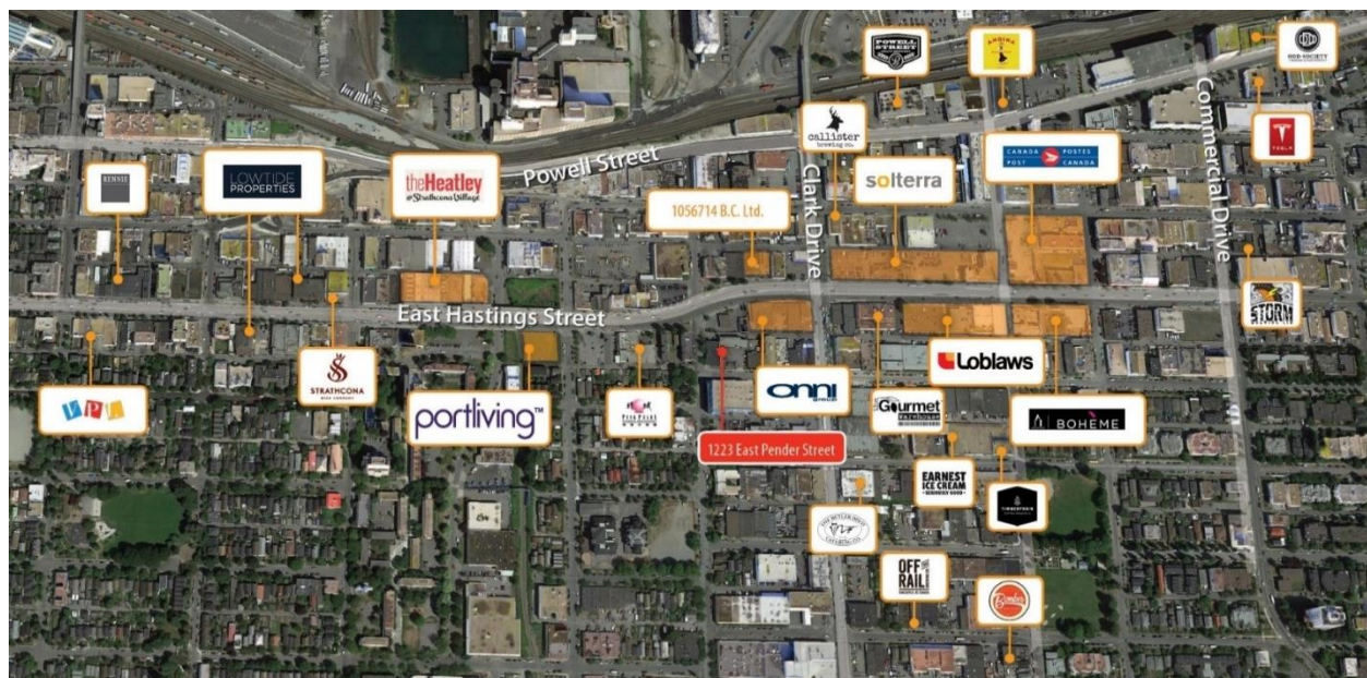
Hastings Street Corridor, Figure 1

Hastings Street is one of the most important east-west traffic corridors in Vancouver. This street has always had different character areas along its stretch, and today it still embodies different roles as it passes through different neighborhoods. It is an objective of the City of Vancouver to make Hastings Street a “great street” again, with focused efforts on building vibrant hubs along different sections to meet the needs of the communities through which it passes. See the City of Vancouver Downtown Eastside Plan, Section 6.6 – Hastings Street ( http://vancouver.ca/files/cov/downtown-eastside-plan.pdf ). In an effort to help facilitate this, many notable developers have strategically purchased property along the corridor in anticipation of this potential growth.